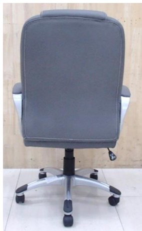
Pic. 3: Back view