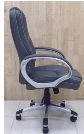
Pic. 2: Side view